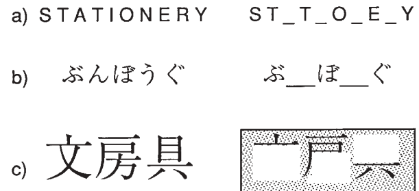
Figure 1. Examples of empty and completed cues of the standard English (a) and Japanese (b) word fragment completion tests, and of the kanji fragment completion test (c).

The subdivision assumption was investigated by means of a study–test shift between hiragana and kanji scripts (for a hiragana/katakana shift, see Komatsu & Naito, 1992). This manipulation can be classified as a perceptual manipulation, because Japanese words have the same meaning when written in hiragana or in kanji , and